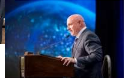
Keynote Address by Mark Kelly