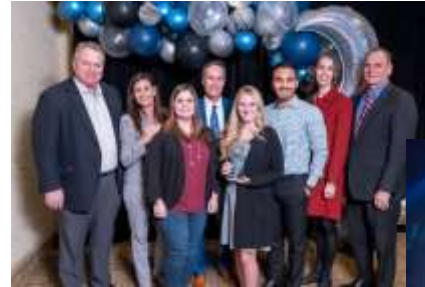
SRP Award Winner