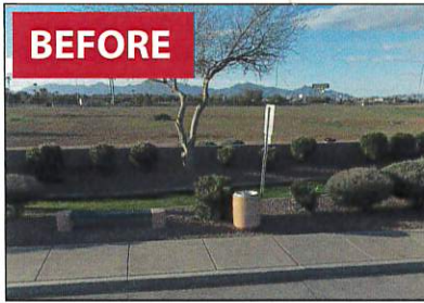
91st Ave/ McDowell Rd New large shelter and amenities.