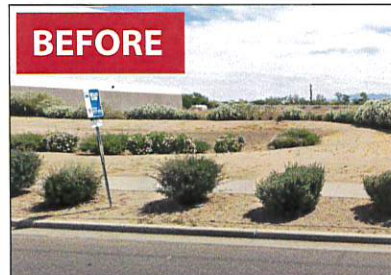
86th Ave/ McDowell Rd New shelter, landing platform and amenities.